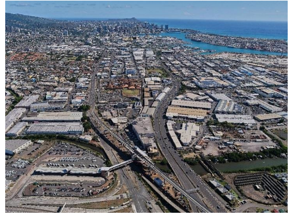
Kahauiki (Middle Street –Kalihi Transit) Station looking Downtown