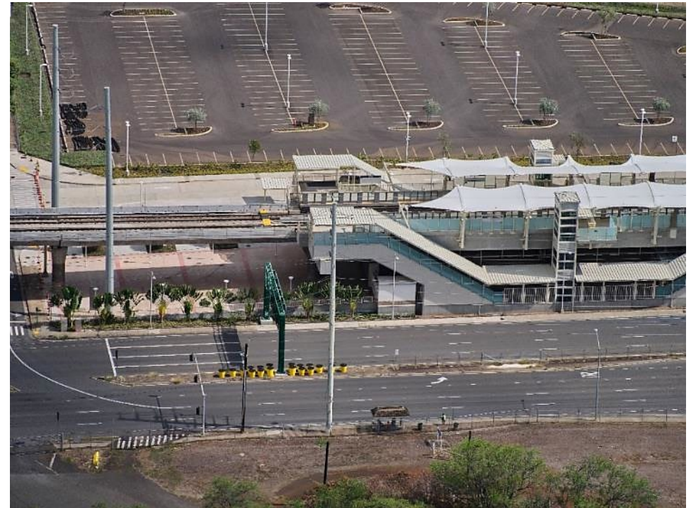
Aloha Stadium (Hālawa) Station