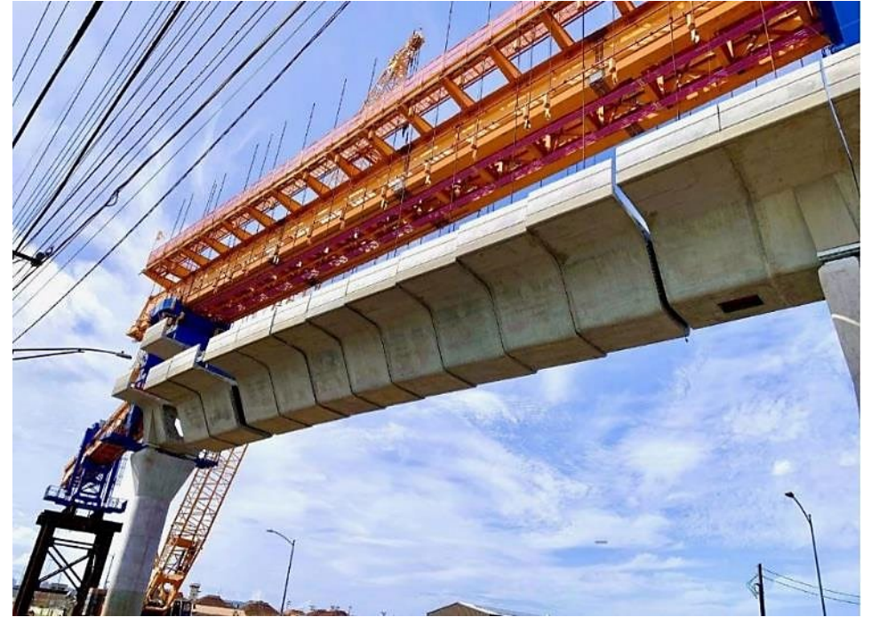
Final AGS Guideway Span Erected – Middle Street (Kahauiki) Station – April 2022