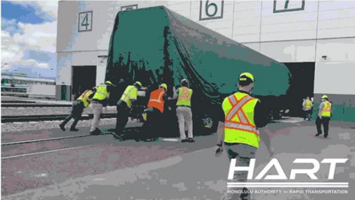
The first of the four cars of HART's 14th passenger train rolled into the Rail Operations Center last Wednesday morning under a police escort. The 60-foot long vehicle was shipped to Honolulu from California, where Hitachi Rail has its final assembly plant.