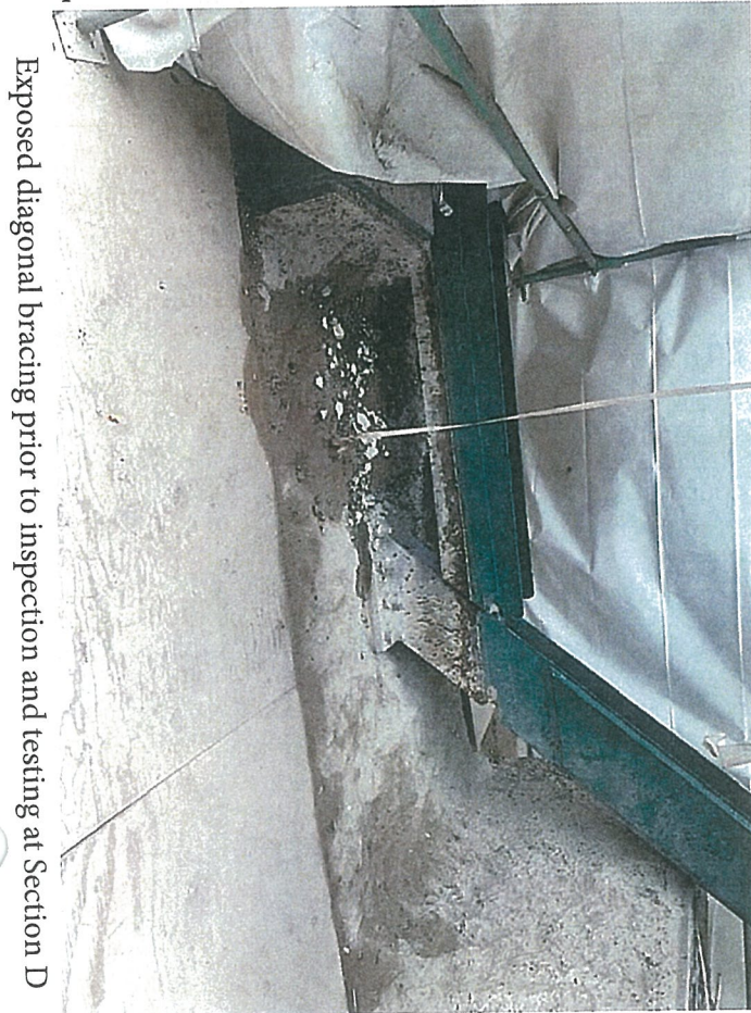
Exposed diagonal bracing prior to inspection and testing at Section D