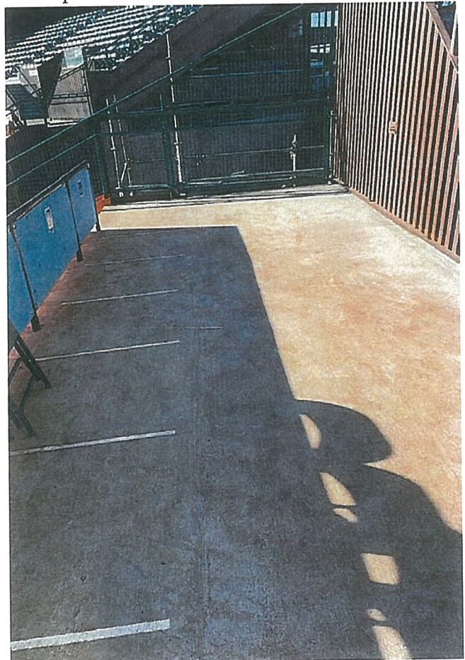
New slab on inner concourse at south end of Section F