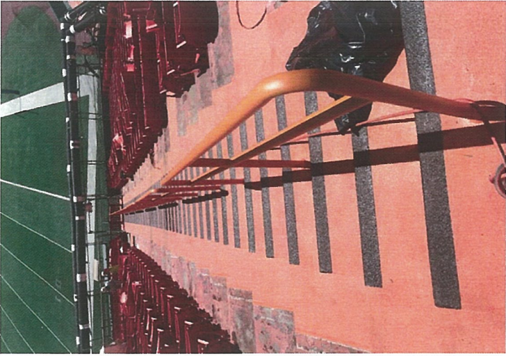
Repaired Stairs Orange F-G