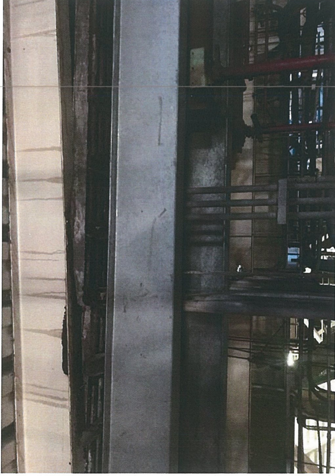
SW Electrical Room Support Beam