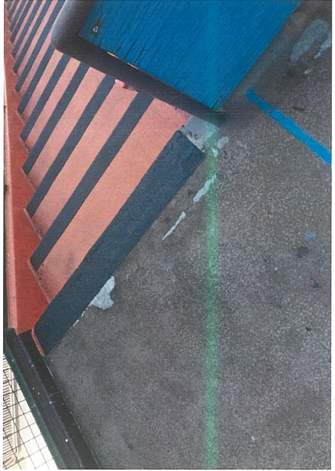
Temp Anti-skid coating at top of Stair FF